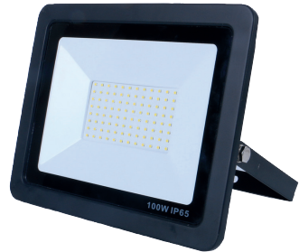
Image shown FLAC100B